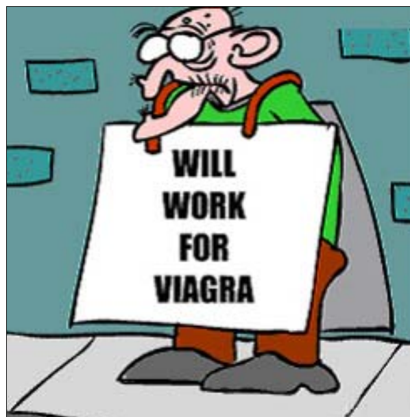
This says it all. Some of us will need to make our signs right away or in the near future!